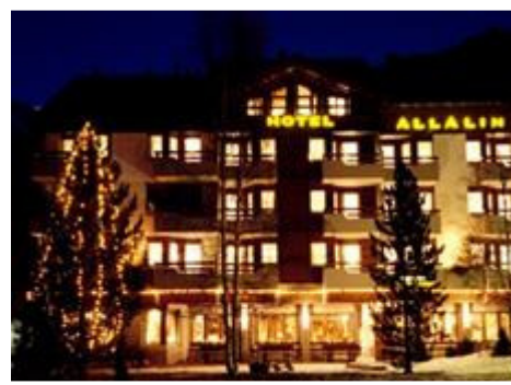
Allalin Hotel from CHF 150 per pax/night **** incl. half board

Saas-Fee Accommodation and Registration available online at: