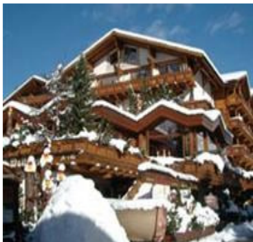
Ferienart Resort and Spa from CHF 190 per pax/night **** incl. half board