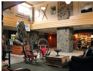
Huntley Lodge ***

All accommodations for the ISFR have been arranged at Big Sky Resort’s Huntley Lodge and Shoshone Hotel (the Huntley is now sold out) which share the same lobby and are just a few yards from the base area lifts. Make your reservation directly with the hotel.