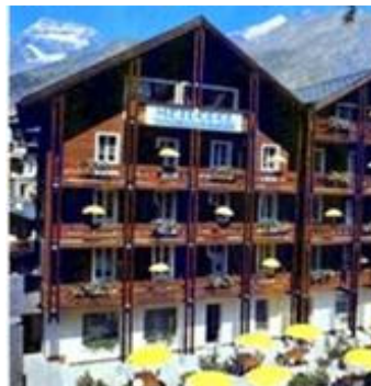
Best Western Metropol Hotel from CHF 140 per pax/night **** incl. half board