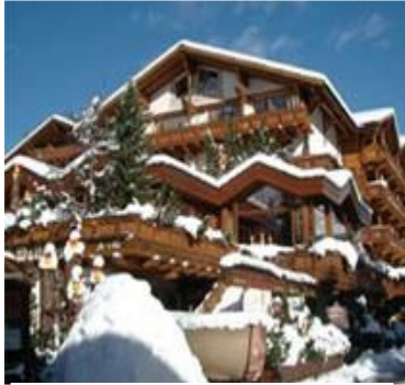
Ferienart Resort and Spa from CHF 190 per pax/night incl. half board *****