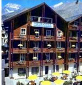
Best Western Metropol Hotel from CHF 150 per pax/night ****