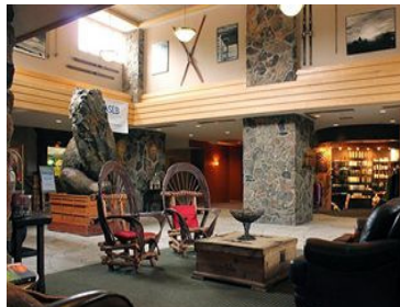
Huntley Lodge ***

All accomodations for the ISFR have been arranged at Big Sky Resort's Huntley Lodge and Shoshone Hotel (the Huntley is now sold out) which share the same lobby and are just a few yards from the base area lifts. Make your reservation directly with the Shoshone.