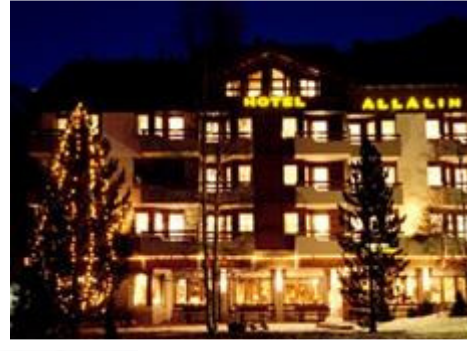
Allalin Hotel from CHF 150 per pax/night ****

Accommodation and Registration available online at: http://saas-fee2015.ch/typo3/index.php?id=2 .