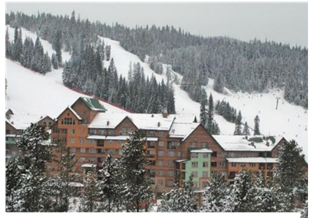
Zephyr Mountain Lodge