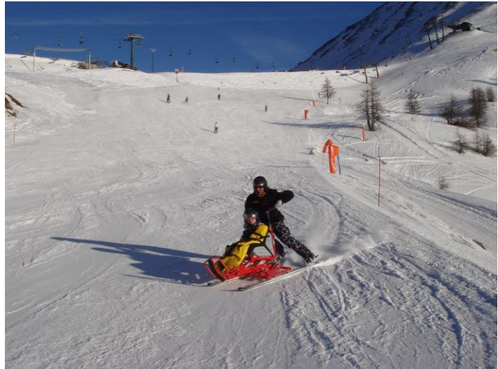
A Freewhite ski teacher and pupil on Sestriere slope

purchase ski equipment for the disabled enabling them to enjoy winter sports. The Sestriere event, fully in the spirit of ISFR, will bring together many friends from around the world who share the passion of winter sports and the Rotary spirit of "Service Above Self."