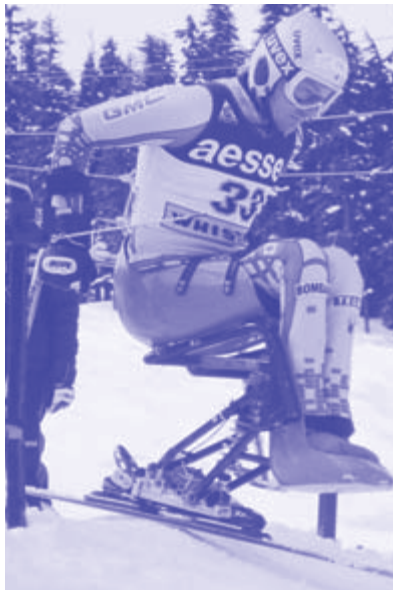
The Start Gate