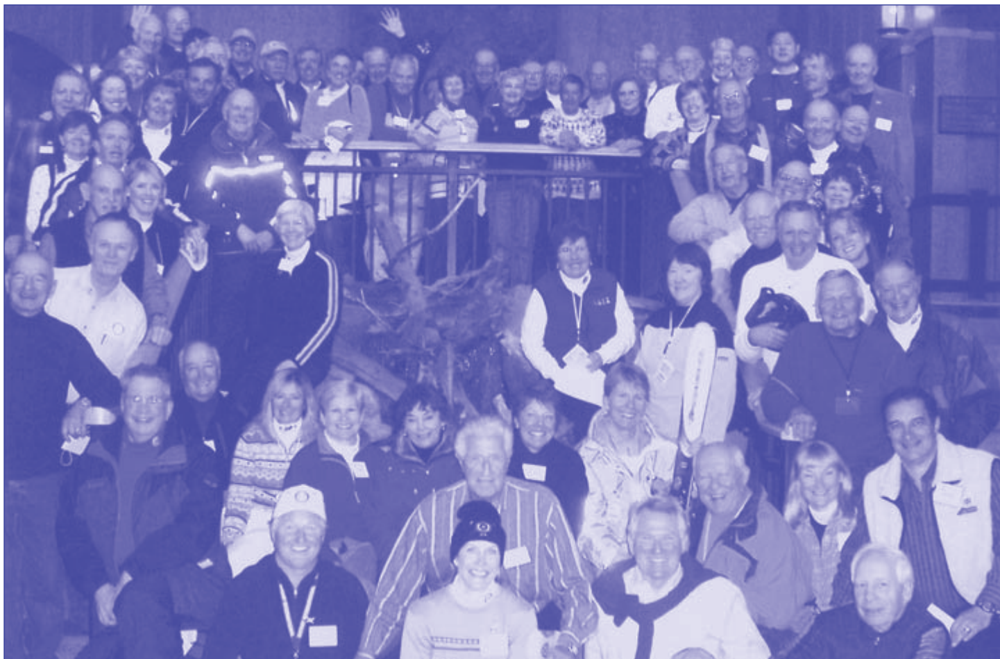
Entire group following the Joint Rotary Meeting.